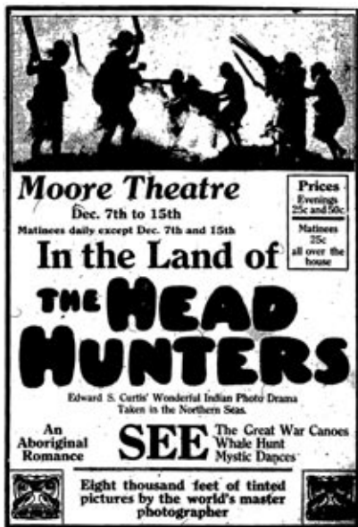
SeattleTimes, December 6, 1914