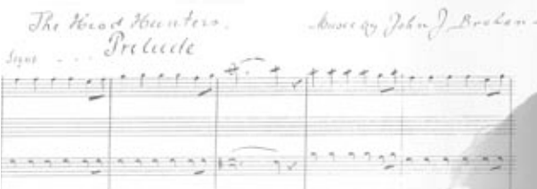
1914

Restored, Re-evaluated, and Framed by a Live Orchestral Arrangement of the Original Score and a Performance by Descendants of the Indigenous Cast